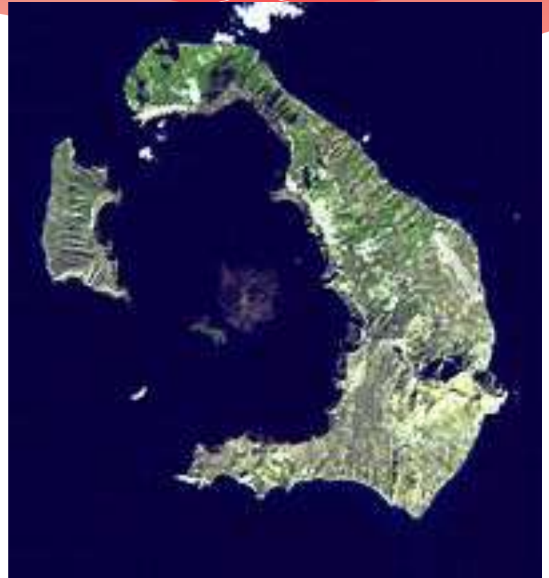
( after eruption)