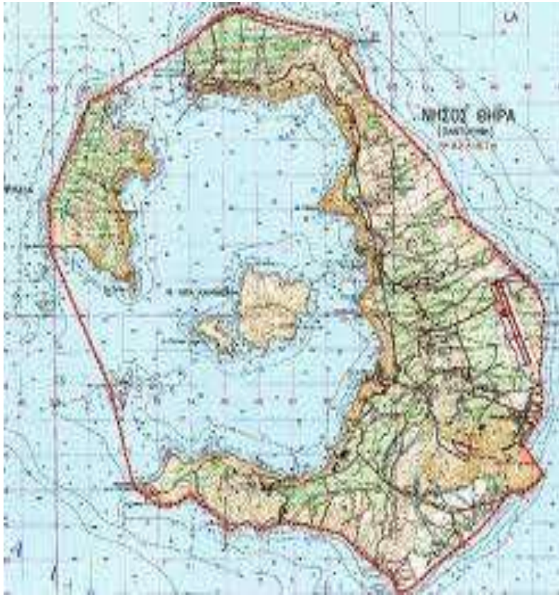
( before eruption)